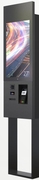
Single-sided floor-mounted kiosk