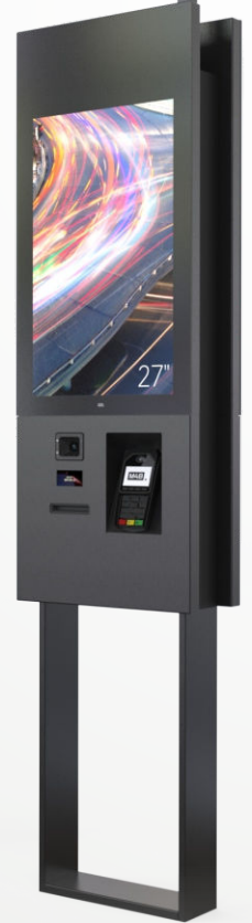
Double-sided floor and ceiling mounted kiosk